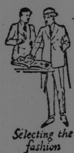
Selecting the fashion

English & Scotch Woollen Co. Tailored-to-Measure Garments cost enough to ensure the worthiness of the materials employed, and a thoroughness of work- manship that lends endurance and ensures satisfaction. Ours is practical tailor- ing on a large scale—we tailor for the masses at a very small margin above the actual expense of production, this in turn being computed at the lowest cost basis of any tailor- ing concern anywhere. Give us the pleasure of taking your measure today.