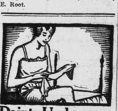
Dainty Underwear for 15 cts!

Persistence Necessary Long continued and persistent effort is always necessary to bring mankind into conformity with great ideas; and a good fight bravely lost for a sound principle is always a victory.—Secretary E. Root.