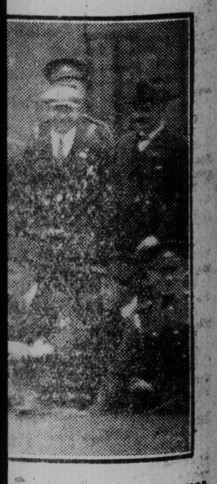
Large group of Toronto men

Mich., Oct. 2.—A proposed to the Michigan constitution would have the effect of abolishing the public schools and the state will go on the November election. The state supreme court has handed down late yesterday its decision on the constitutionality of the amendment. It had been enacted, and requirements had been met, it was ordered upon opinion held the amendment unconstitutional.