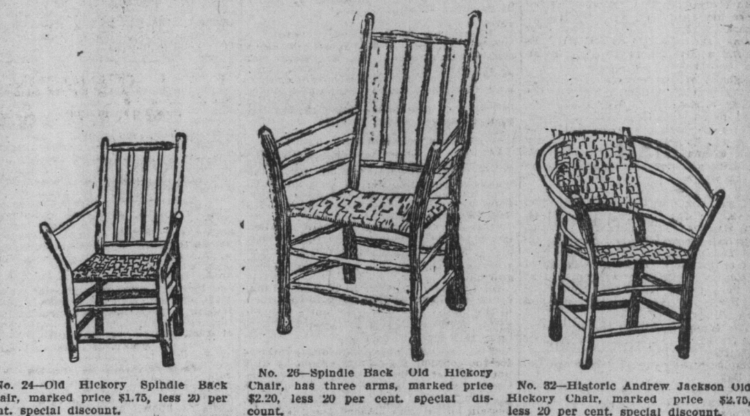
No. 24—Old Hickory Spindle Back Chair, marked price $1.75, less 20 per cent. special discount.

This week we have put on sale rather more than a complete carload of this Old Hickory Furniture. We appreciate the fact that the season is short for special goods of this kind, and, to make quick selling, have resolved on a straight discount of 20 per cent. off the marked price of everything. The lot includes not alone a wide range of chairs but also settees and tables. Some lines that will suggest others: