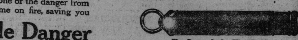
To Carry It In The Pocket

This Lighter is made of Three Brass Tubes, Beautifully finished and full Nickel Plated. Made to hang by your Gas Range, or closed