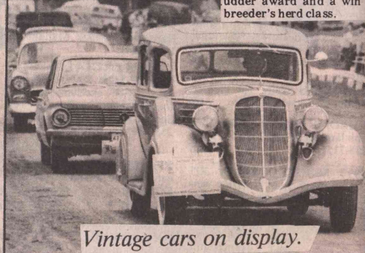
Vintage cars on display.