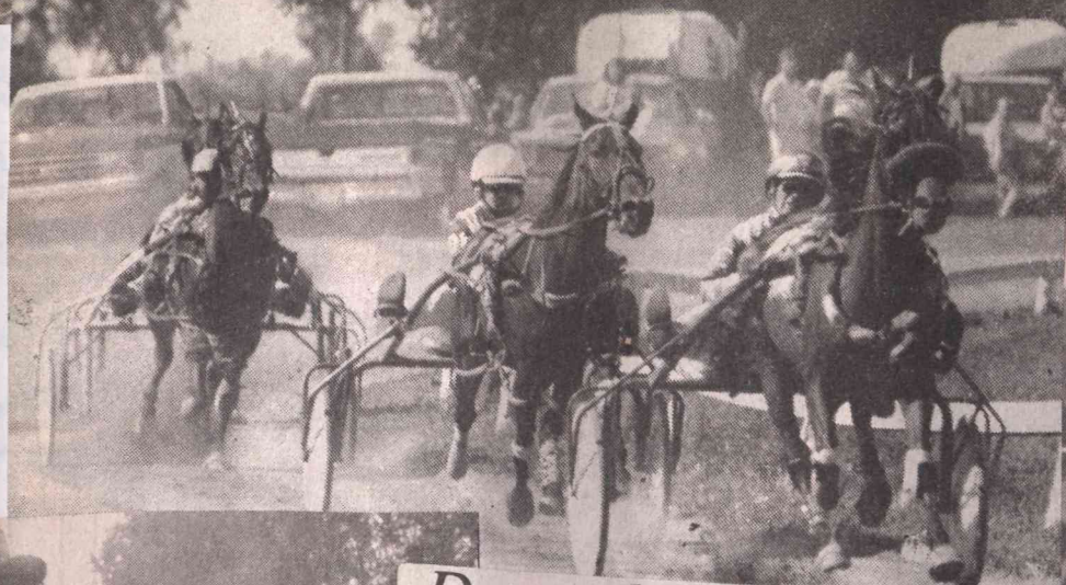
Down the home stretch

The barrel-racing competition was one of the highlights of the South Mountain Fair's western horse show.