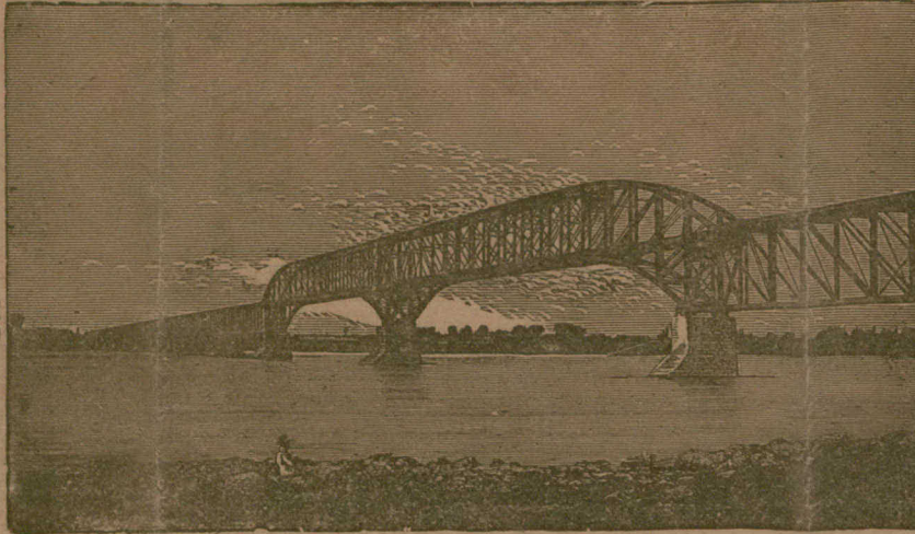
ST. LAWRENCE RIVER BRIDGE CANADIAN PACIFIC RAILWAY, LACHINE, P. Q.

Manufacturers of Iron and Steel Bridges For Railways and Highways.