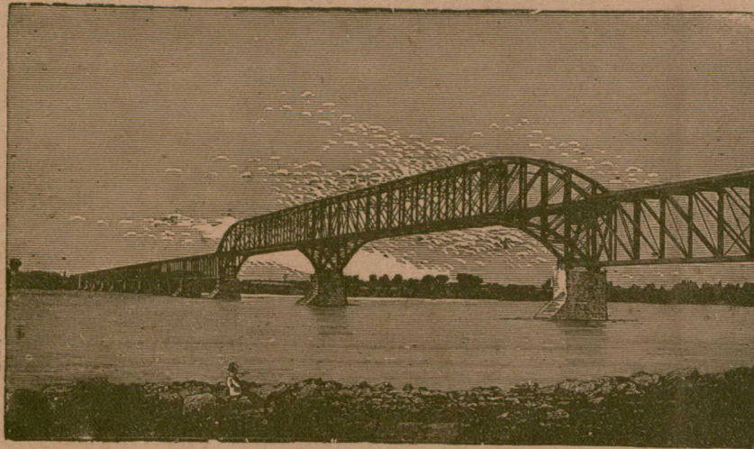
ST. LAWRENCE RIVER BRIDGE, CANADIAN PACIFIC RAILWAY, LACHINE, P. Q.