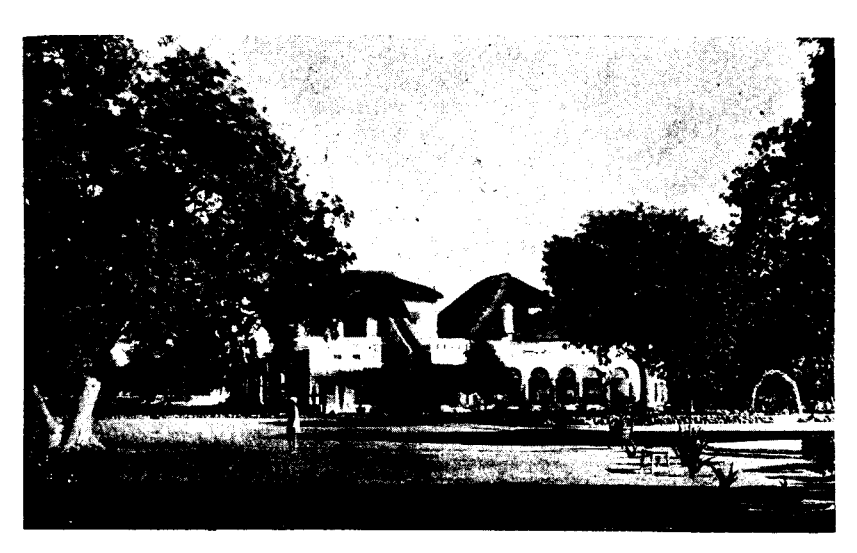
A TYPICAL EUROPEAN BUNGALOW, AGRA.

of dress, the native servants provide their own food and clothing. The mehtar, or sweeper, is the only servant who will eat the food that is left from the sahib's table. The sweeper is not troubled with many scruples of caste, as he is a Sudra, the lowest of the low, whose very shadow is, by the Brahmans, declared to be contaminating.