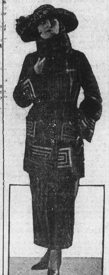
Snug-Fitting Beaver Collar.

These neck pieces have the advantage of being less expensive than the animal scarfs of costly, longer haired furs, and this is a distinct advantage when it comes to matching a muff