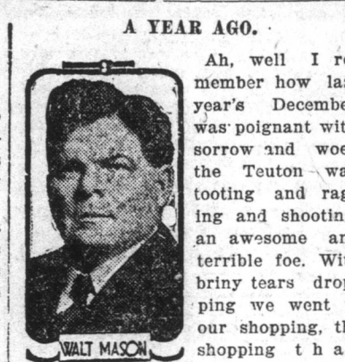
A YEAR AGO.