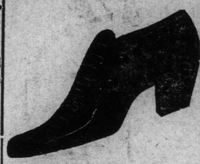
LADIES' PATENT 7-STRAP EVENING SHOES, Cuban heel, very effective, as cut, $2.50. Ladies' White Kid Evening Shoes, silk and satin bow effects. $1.50, $1.80. Ladies' Patent Pumps, $1.25, $1.45, $1.80, $2.70, to $4.50.

MEN'S PATENT DRESS SHOES, Pumps, $1.60, $2.00; Oxfords, $1.25 to $1.90. BOYS' PATENT PUMPS, $1.45 to $1.65; according to size.