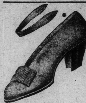
LADIES' SATIN PUMPS. in Black, White, Blue, Pink and Crimson Pom Poms, with detachable strap. $3.00.