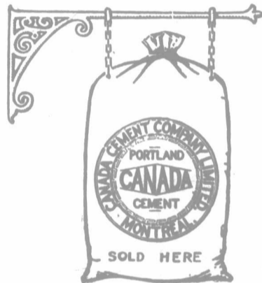
THIS sign hangs in front of nearly all our dealers' stores. Let it guide you to the place where the best cement is sold.

You can easily see why a company that is devoting this much attention to the farmers' needs is in better position to give you—a farmer—satisfactory service. Canada Cement will always give you satisfactory results. Every bag and barrel must undergo the most rigid inspection before leaving the factory.