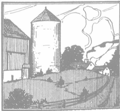
CONCRETE is the ideal material for barns and silos. Being fire, wind and weather proof, it protects the contents perfectly.

Concrete may be mixed and placed at any season of the year (in extremely cold weather certain precautions must be observed) by your-