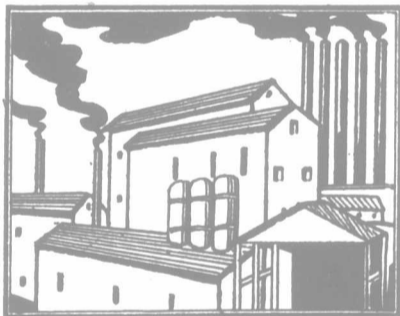
OUR mills are located all over Canada, so that no matter where you live you can get Canada Cement without paying high prices caused by long freight hauls.

YOU should use concrete, because by so doing you can make your farm more attractive, more convenient, more profitable and more valuable.