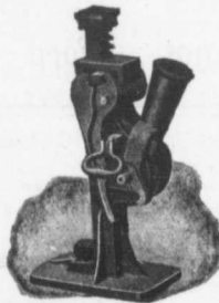
"Sure Drop" Track Jack.