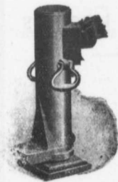
Cone Bearing Jack with foot lift.

We will be glad to send you our Pocket Catalogue on Jacks. Mailed on request.