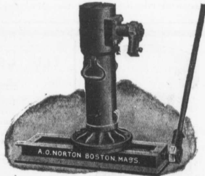
Ball Bearing Traversing Jack.

MADE IN ALL STYLES FOR EVERY CLASS OF WORK