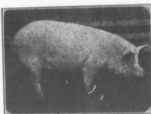
A Premium Pig

This is a picture of the type of pig that Farm and Dairy are giving away. It is a Yorkshire, splendid for bacon and for which there is always a good market.