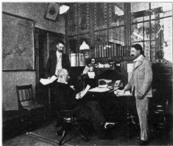
A CORNER IN THE BOOK STEWARD'S OFFICE.

for a printing establishment." What would these worthy brethren think if they could walk through this immense institution to-day? Imagine their astonishment when informed that there is