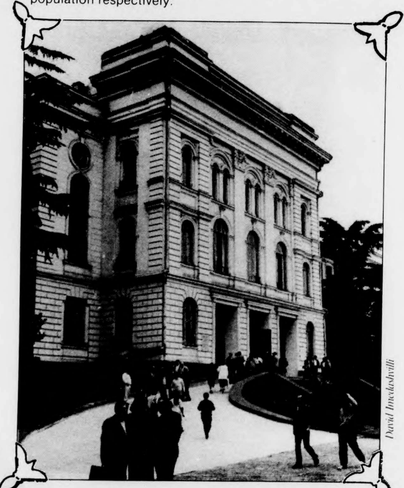
A campus building at Tbilisi State University

Some republics, such as Georgia, have cultures and traditions as old, if not older than those belonging to Russia. In Georgia, 68.8 per cent of the population is Georgian while its two major ethnic minorities, Armenians and Russians, make up 9.7 per cent and 8.5 per cent of the population respectively. In Russia, the Russian majority makes up 83.5 per cent of the population while its two largest minorities, Ukrainians and Kazakhs, make up 7.11 per cent and 4.31 per cent of the population respectively.