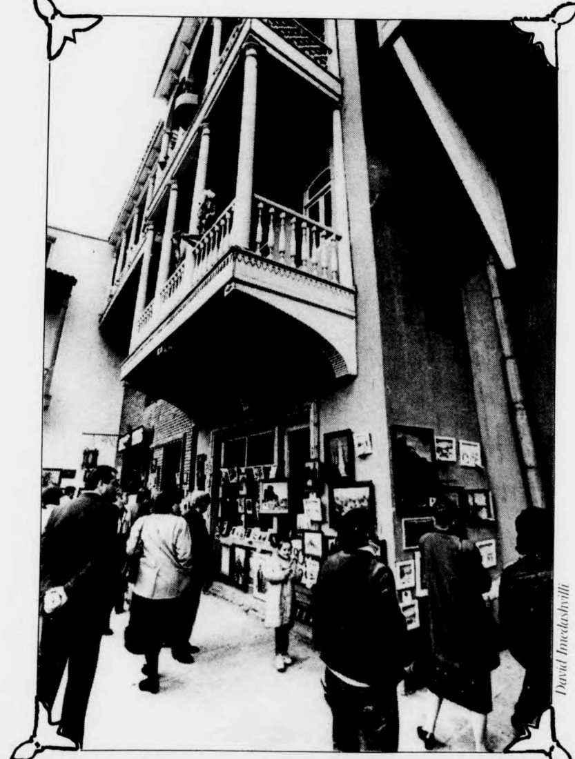
In the streets of Tbilisi

York students will be able to learn more about Soviet university life in September 1990 when Excalibur will publish diaries of the trip. For more information about the exchange contact Jacob Katsman at Excalibur 111 Central Square, 736-5239.