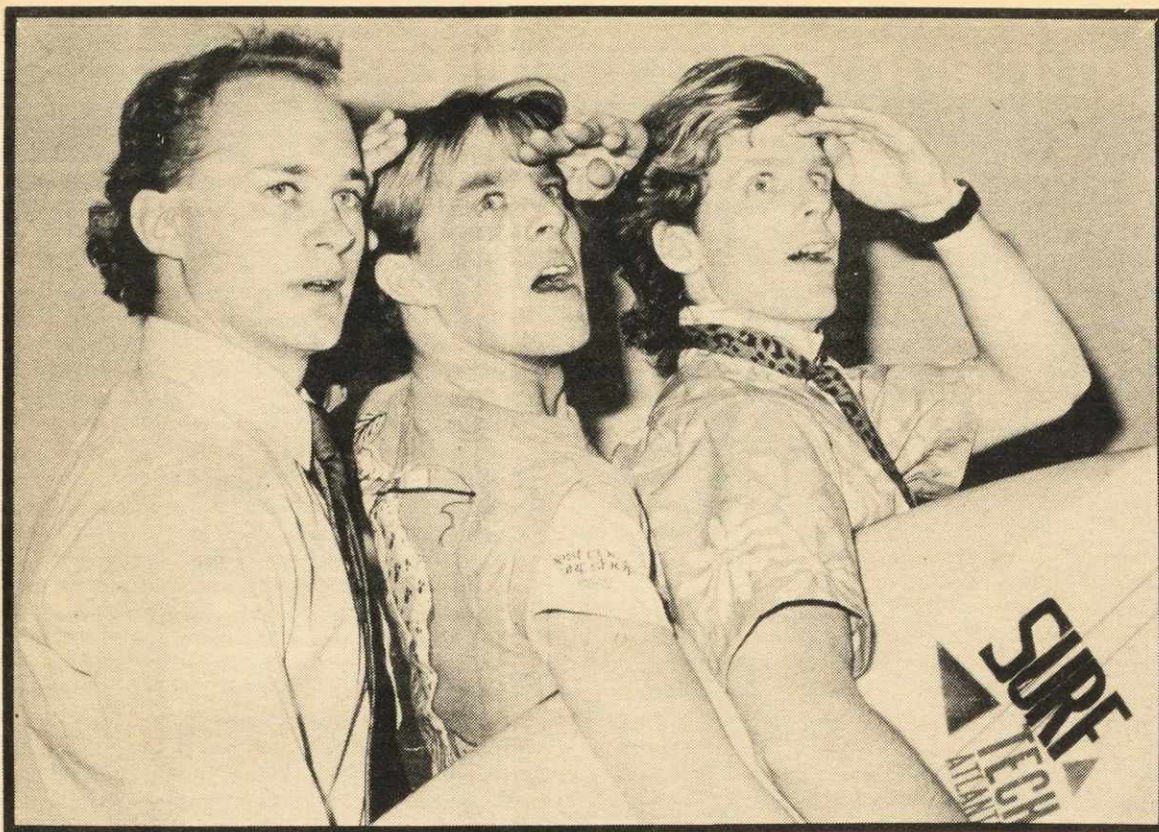
The Surf Tech Atlantic trio are more than prepared for the big wave expected.

A 5-foot, eight-inch native of Simpson's Corner, Nova Scotia, Turner is recognized as one of the