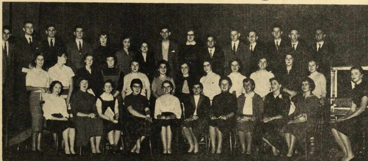
THE CHORUS OF "IT'S A STEAL" is shown above taking a break from practises for the new D.G.D.S. revue which will be presented in the Dal gym Nov. 17, 18 and 19.

Those who remember "T.V. Or Not T.V." last year will find that "It's a Steal" is a little wilder, a bit odder, and has no connecting central theme. It has