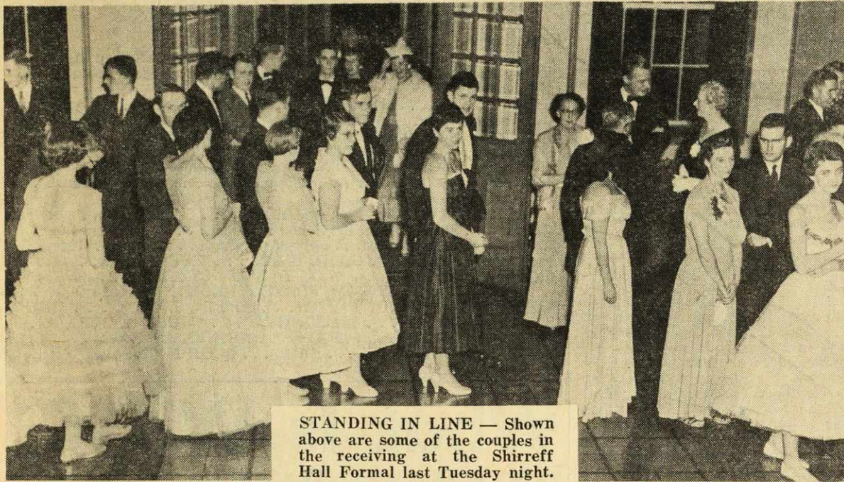
STANDING IN LINE — Shown above are some of the couples in the receiving at the Shirreff Hall Formal last Tuesday night.