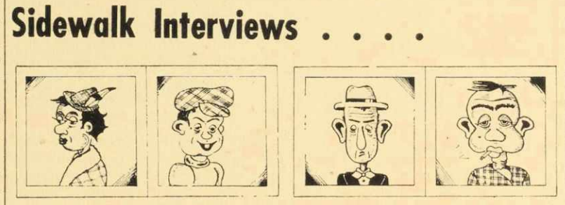
Who, in your opinion is the Man of the Millenium?

in his stand he may bring about the greatest unemployment crisis further report on the findings tothe world has yet faced. Federal morrow.