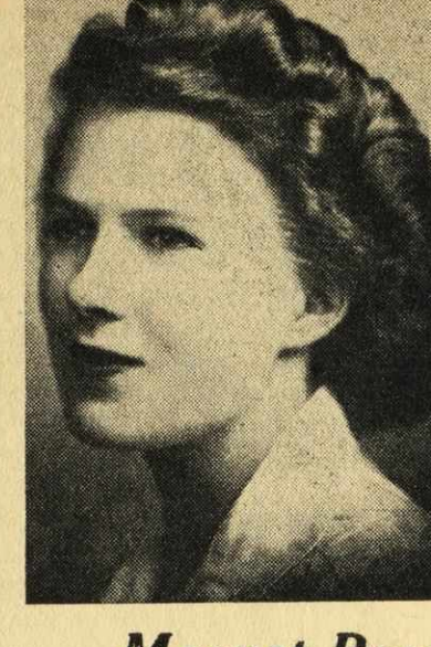
Phi Chi ...