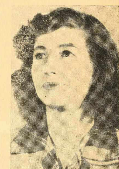
Sigma Chi . . .