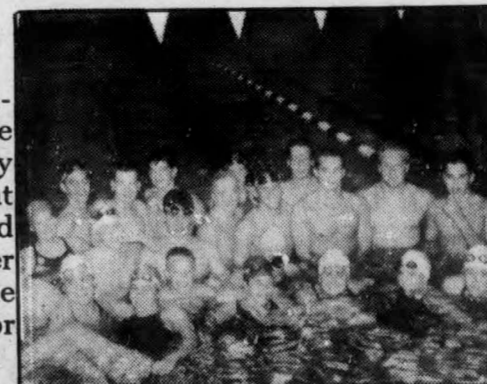
File Photo: Last year's swim team