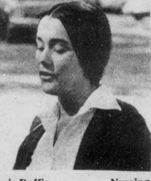
I like it so far. I think it's good.