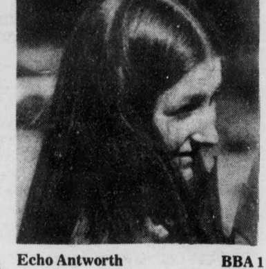
Arts 1 Echo Antworth