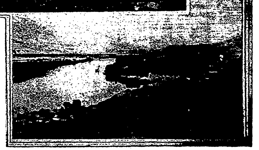
Views at Kamloops.

recent growth has been towards the station, so that it is badly scattered The majority of the hotels and several stores are at the old town, but the most of the business places are in the newer portion, while the intervening space is partly occupied by dwellings. Previous to the construction of the Crow's Nest Pass rallway, this was a busy place as all the traffic over the Pk. to West Kootaney points had to come through Revelstoke. A large portion of the business now goes in by way of Nelson, but this is st'll an important divisional point, and is the suply depot for the Lardo district to the south, and the Big Bend country to the north, and, of course, all the traffic from the west to the Kootenay and Boundary district still comes this way.