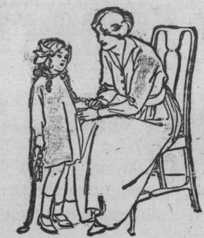
Constipated Children Gladly Take