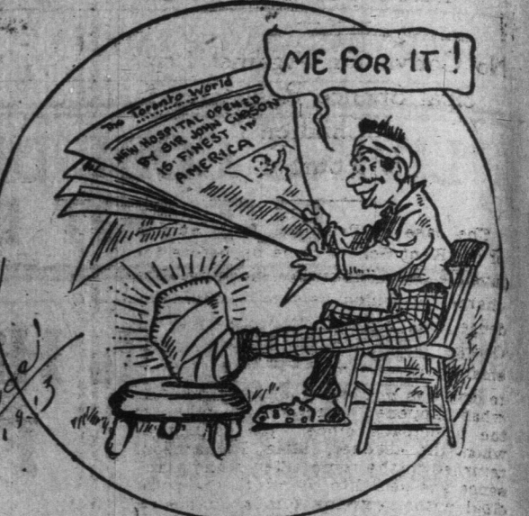
OPENING NEW GENERAL HOSPITAL