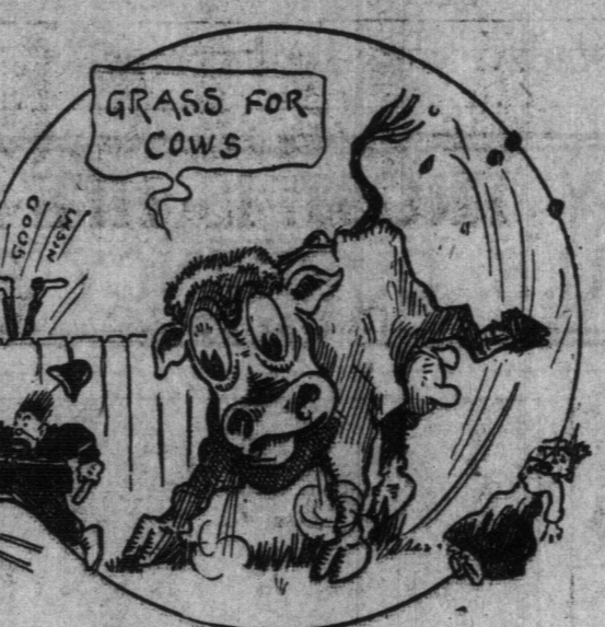
THE TORONTO MILITANT COW