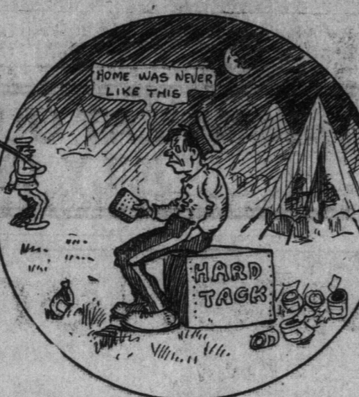
STILL AT NIAGARA CAMP