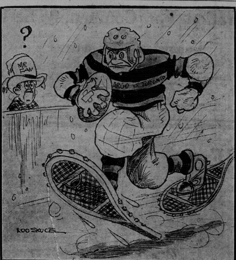
MR. FAN SAYS: Has it come to this?

The Varsity senior team leaves here on Saturday morning, and will get a good rest before the game. The Varsity seconds, who play Queen's II. in the morning for the college intermediate championship, will leave for Kingston this afternoon. The seconds have a five-point lead, gained here last Saturday.