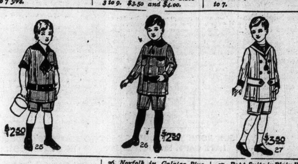
25. White and Blue Stripe and White Stripe, Dark Blue and White Stripe, Dark Blue Trimmings. Sizes 3 to 7.