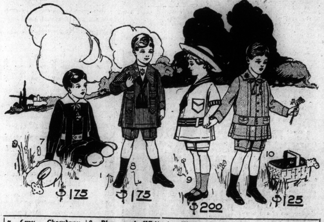
Crey Chambray, 8. Blue and White 9. White Drill, with 10. Plain White Collar and Belt. Stripe Middy Suit. Blue and White Trimwith Wide Sizes 3 to 7. Sizes 3 to 7. Sizes 3 to 7.