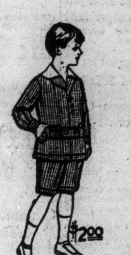
24. Drill Suit in Black and White or Tan and White. Sizes 3