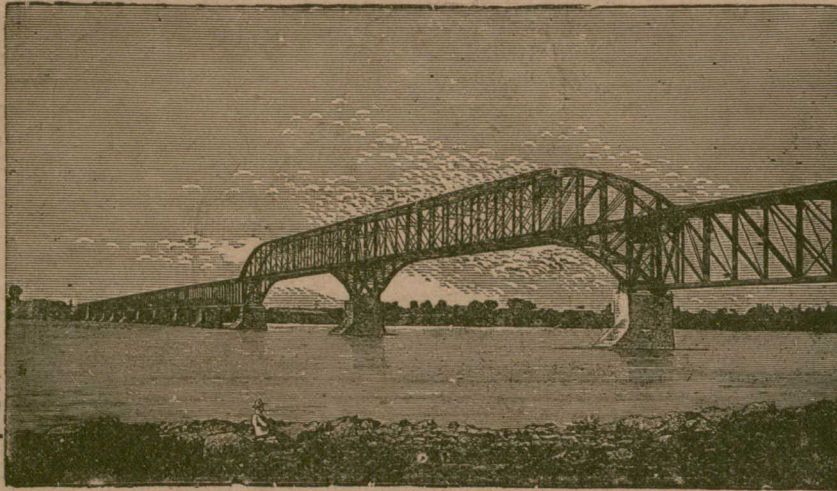
ST. LAWRENCE RIVER BRIDGE, CANADIAN PACIFIC RAILWAY, LACHINE, P. Q.

The cost of Metal Bridges, for a term of years, is less than the cost of building repairing and replacing wooden bridges, and believing the only reason so many bridges are still built of wood to be that those who are charged with the duty of contracting for them are not aware how little difference there really is in the first cost of a good Iron or Steel Bridge and a well-built wooden one, of equal strength, we are at all times pleased for an opportunity to quote prices to officers of counties, cities and townships, so that they may intelligently compare the cost of metal and wooden bridges. To enable us to name prices closely we need information on the following points: Number of spans and length of each span. Width of roadway and number and width of footways and sidewalks. Kind of Lumber to be used for floor joists and plank and its value. Name of nearest R. R. Station and distance of bridge site from station. Depth of water at ordinary level and height of floor above water. Also strength and capacity of bridge required, if any particular strength has been determined on; or a general statement as to the nature of travel over the bridge; whether on a country road, a well-ballasted turnpike, or located in a village or city, and subject to heavy loads.