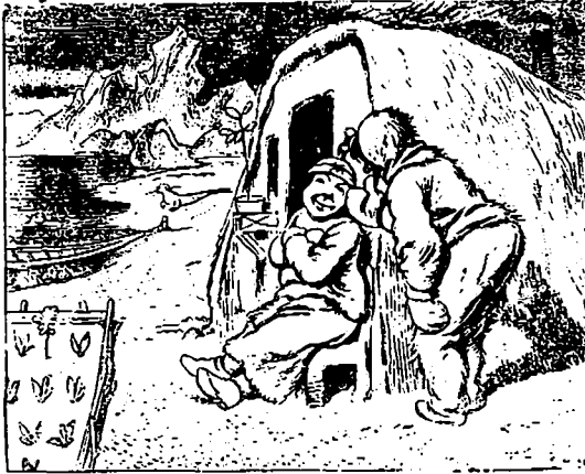
LOVE IN GREENLAND.

ROMEO.—“ Why art thou so cold toward me, Juliet ? ”