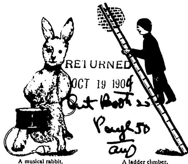
A musical rabbit.

And combined with all these novel ideas and interesting manoeuvres of the mechanical toy is a cheapness that