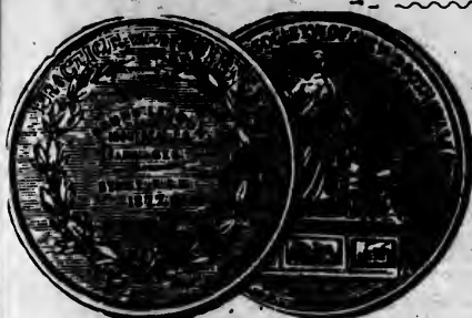
First Prize Bronze Medal and Diploma for Carriages, awarded at Sydney, N. S. W., 1877.

BY SPECIAL APPOINTMENT, CARRIAGE-MAKER FOR H. R. H. THE PRINCESS LOUISE AND HIS EXCELLENCY THE MARQUIS OF LORNE.