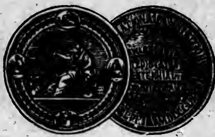
First Prize Diploma awarded Centennial Commission, Philadelphia, 1876.