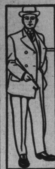
Appearance ruined by slouchy shoes

A handsomely attired pair of masculine feet are as scarce as radium. Never thought of it, did you? Well, it's a fact. Next time you're at the club inspect the feet of exquisitely dressed men. You'll find hardly one smartly dressed foot. There'll be plenty of gaudy shine and polish, but clumsy fits, unbecoming shapes, bowed up and warped soles, wrinkles and all sorts of bad taste and slovenliness. Astonishing situation when you consider that the style of a Hundred Dollar suit is converted to slovenliness when hung over slouchy boots. Here is a recipe for making a pair of handsomely dressed masculine feet. Call on the Foot-rite retailer in your town. His name's below. His door swings inward but never outward to find a more welcome store. Allow him to select several pairs of Foot-rites of different shapes and styles and let him do the selecting. He's a shoe expert and knows better than you what best becomes you. Wear one pair keep the others on trees, change daily and shine daily with a dull finish and you'll have well groomed and admired feet.