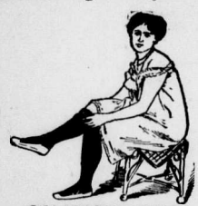
COMFORT HOSE Glove Special

Your Hosiery needs are well looked after at this store. It is our interests to serve your best interests. We show the best assortment of Hosiery and Underwear to be seen anywhere. Ask for the "Mule Skin Stocking for Boys."