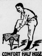
COMFORT HALF HOSE A Special in Men's Waterproof Collars

The men who are the most particular about the style of their out-fittings are the ones we aim to please. We have opened up a fine stock of new Neckwear and Regatta Shirts this week. The assortment may be seen in our window.