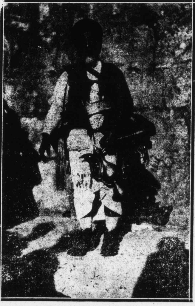
Beverage Peddler in Cairo Beverage Peddler in the Cairo Bazaar photographed on Canadian Pacific S.S. Empress of France during her world tour which concludes May 2 and then goes on the "Round America" trip via San Francisco, Balboa, Colon, Havana to New York which is reached May 23. A number of Canadians will take this latter part of the trip.

If the facts of the case as reported by the Canadian Press are correct, I consider the British government has committed another stupid blunder and struck a dangerous blow at imperial friendship.