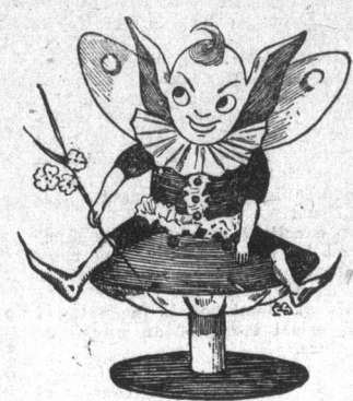
A BRIGHT LITTLE PUCK.

Now that the festival of Easter is so close upon us many of our readers are doubtless on the lookout for seasonable novelties with which to decorate their dinner tables or to present to their children and friends, since the old time custom of the distribution of Easter