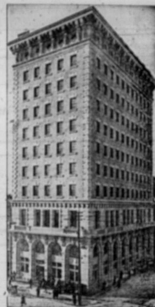
Union Bank Building, Winnipeg

BRITISH COLUMBIA - Prince Rupert, Vancouver