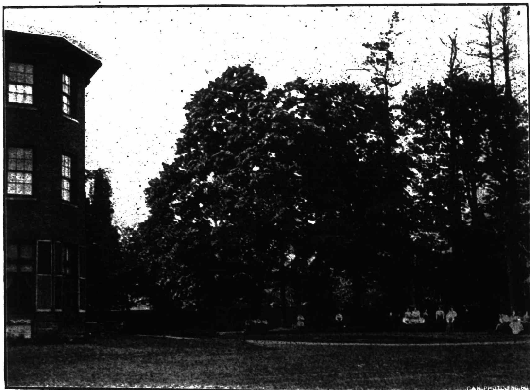
THE BISHOP STRACHAN SCHOOL—A CORNER OF THE GROUNDS.

The pilgrimage to Iona, organized by the Roman Catholic authorities, took place on Tuesday. The cathedral, as fitted up for the Presbyterians, was obtained by them for their service, the Roman Catholic Bishop of Argyll and the Isles celebrating Holy Communion, and the Roman Catholic Archbishop of St. Andrew's preaching the sermon. Church Times.