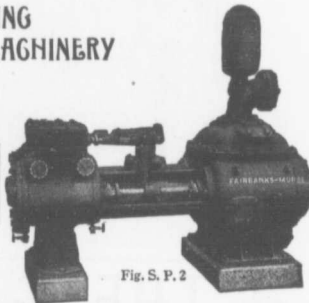
Fig. S. P. 2

The Canadian Fairbanks Co., Limited MONTREAL TORONTO WINNIPEG VANCOUVER