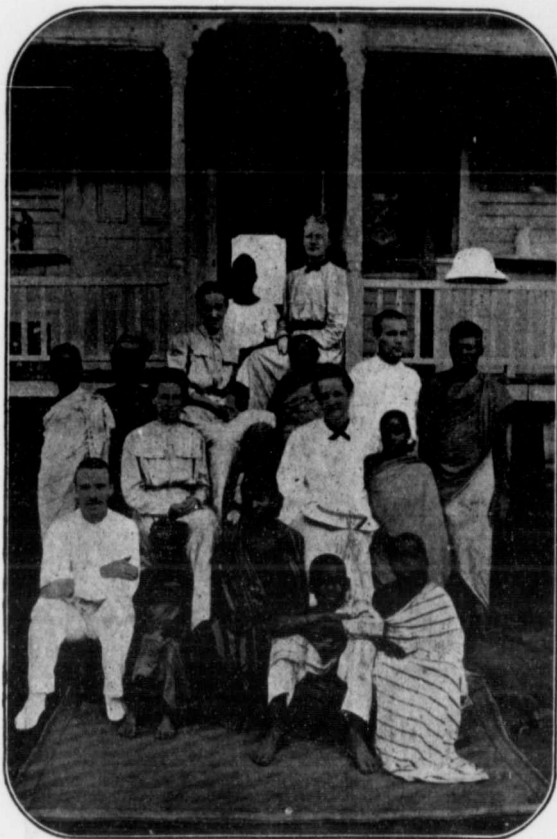
THE M. B. C. MISSION FAMILY, SHONGA.