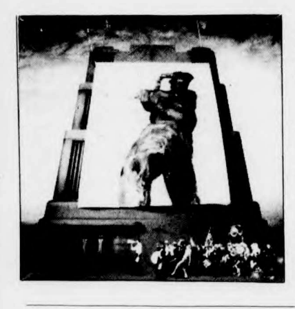
Spandau Ballet-Parade (MCA)

This band is one which has experienced a radical transformation in the last two years. One of the pioneers of the 'blitz' movement in the U.K., Spandau Ballet is now a fledgeling member of pop music's glamorous establishment, and their music seems to suffer for it.