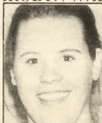
CIAU Rookie of the Year