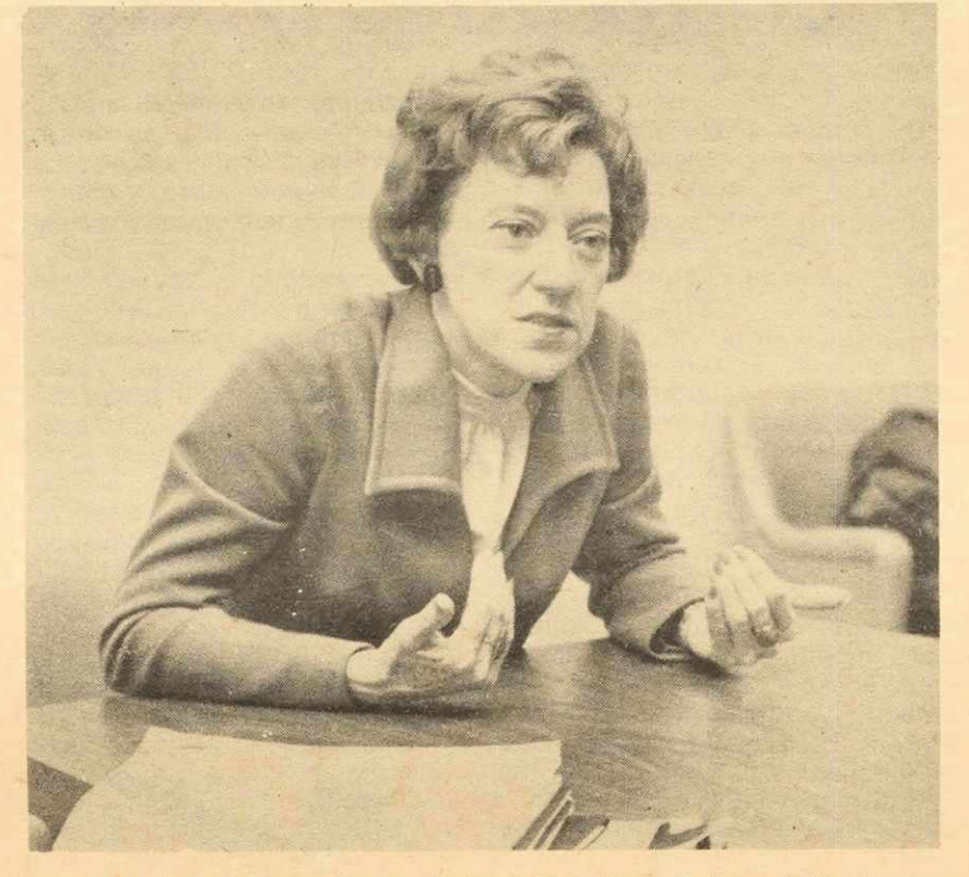
Flora MacDonald speaking to Dal student.

But can they do it? My guess is that they can't, or at least not in the next election, the reason being the successful polarization of the political climate in Quebec since Prime Minister Trudeau's advent to power. In the early 1960's Prime Minister Pearson's indecisiveness regarding Quebec's demands arising from the "Quiet Revolution" had resulted in a de facto, though not officially sanctioned special status for that province. People became concerned that the situation would eventually slide into separation and so Trudeau rode into victory in 1968 with a platform proclaiming that Quebec was a