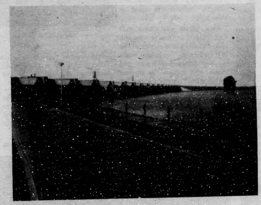
Dykes hold back the water.