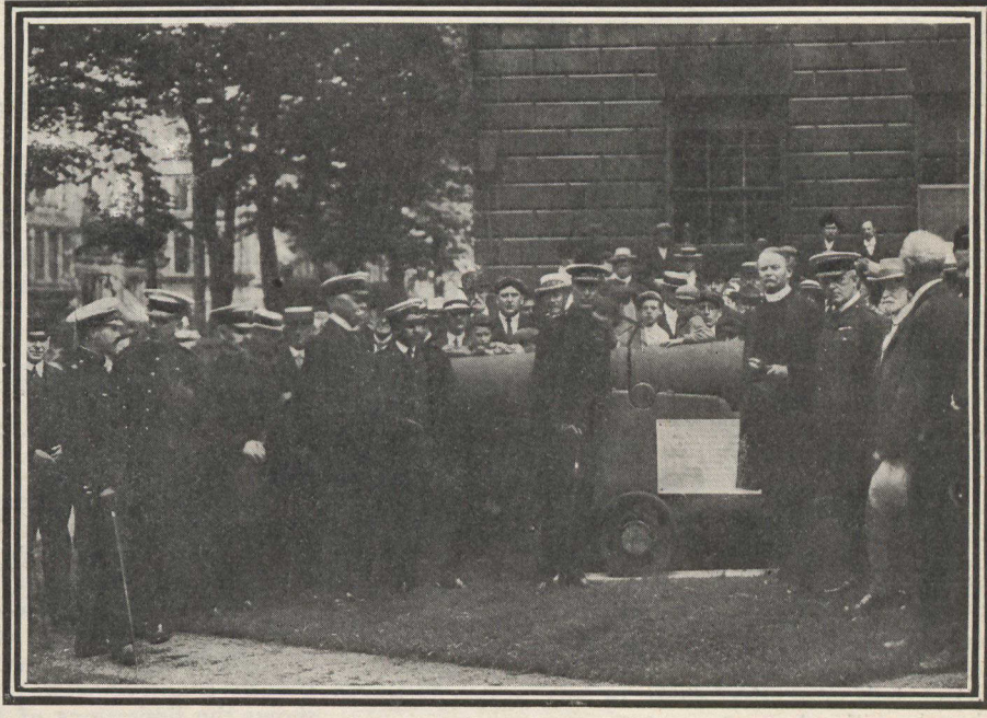
The Same Day Sir Ian Hamilton Unveiled a Tablet on the Historic Gun Used on the Shannon in her Memorable Battle with the Chesapeake, June 1st, 1813.