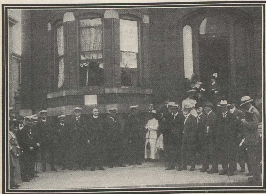
On July 11th a Tablet Was Unveiled by the Minister of Militia at the Birth-place of Sir John Inglis, the Halifax Hero at the Siege of Lucknow in 1857.