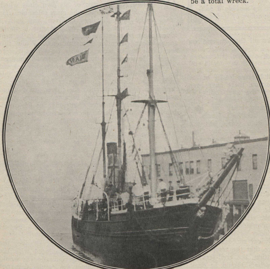
The Diana of the Crocker Expedition Ready to Sail From Boston Eight Days Before Being Wrecked at Barge Point, Near Battle Harbour.