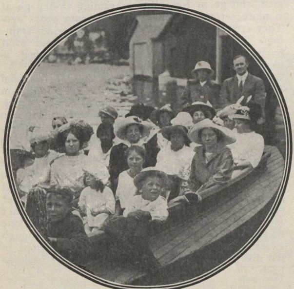
A Boat-load of People Going Down Lake Simcoe to the Famous Lennox Picnic, Last Week.

"The sealer Diana, conveying MacMillan's Crocker Land expedition northward, went ashore last night in a dense fog at Barge Point, forty miles west of Battle Harbour, Belle Isle Straits, and is likely to be a total wreck."