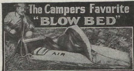
(Successors to Metropolitan Air Goods Co.)

Peterborough Canoe Co., Ltd., Peterborough, Canada