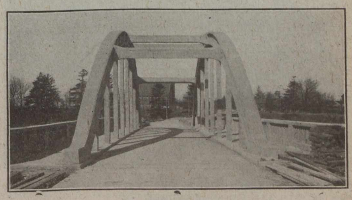
THE BRONTE BRIDGE

The following description of the Bronte bridge will serve equally well as a description of the Etobicoke and Credit bridges, as the dimensions and details of construc-