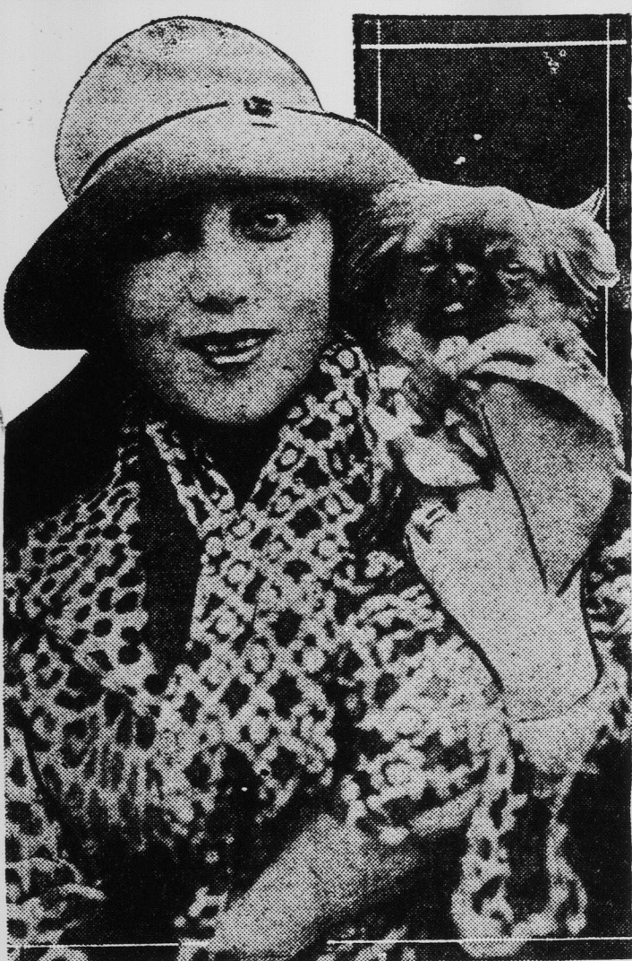
Senora Raquel Meller, whose triumphant debut on the American stage won her tremendous acclaim last spring, has decided she wants to live in a country which appreciates and pays well for her style of stage presentation. So she has sold her property abroad and intends to make America her home.