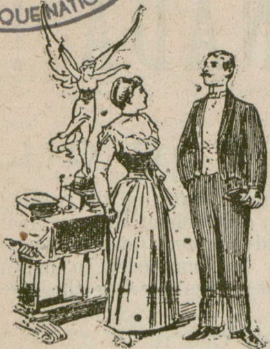
AN ARTISTIC NATURE.

Mr. Apington—I don't like to read Dickens, because I am afraid I should grow so familiar with those beastly cads, don't you know, that when I saw them in real life I should not be properly shocked.