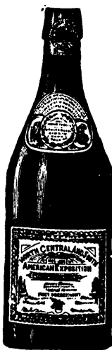
FAC-SIMILE OF WHITE LABEL ALE